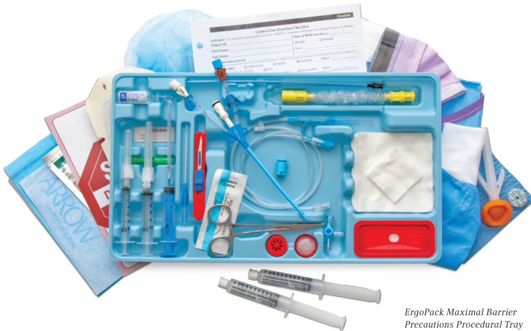
ErgoPack Maximal Barrier Precautions Procedural Tray