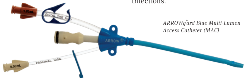
ARROWg + ard Blue Multi-Lumen Access Catheter (MAC)

The ARROWg + ard Blue MAC catheter uses Teleflex's proprietary chlorhexidine based antimicrobial technology proven to protect your patients from the known pathogens of Catheter-Related Bloodstream Infections.