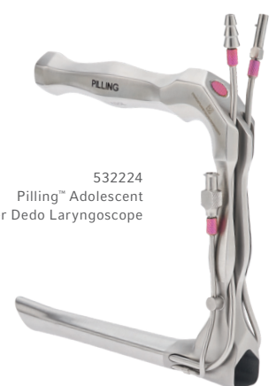
532224 Pilling™ Adolescent Laser Dedo Laryngoscope