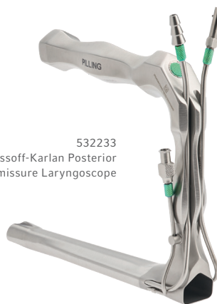
532233 Pilling™ Ossoff-Karlan Posterior Commissure Laryngoscope