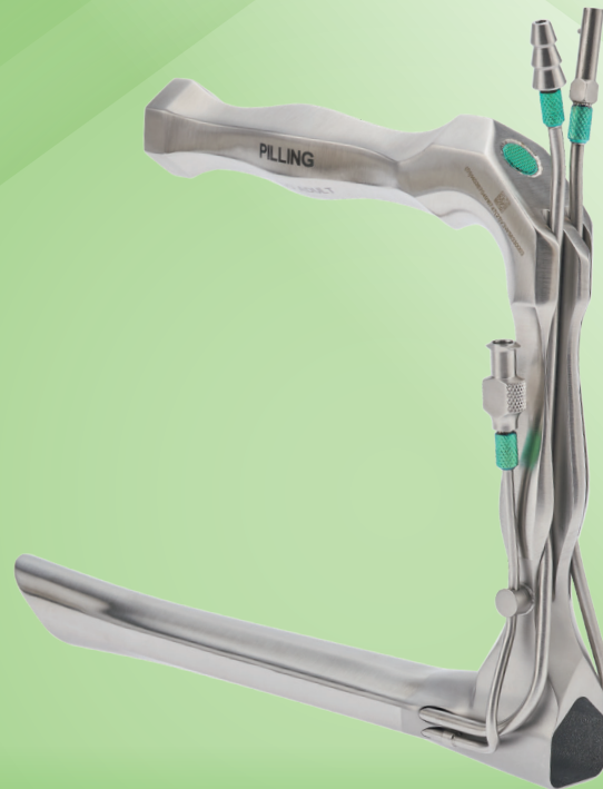
532221 Pilling™ Adult Laser Dedo Laryngoscope