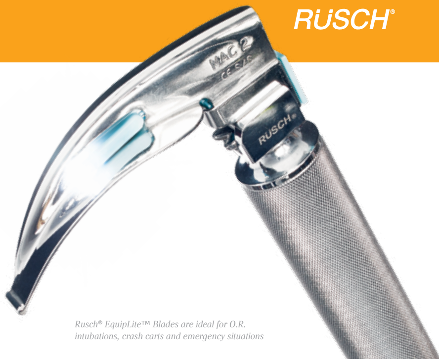
Rusch® EquipLite™ Blades are ideal for O.R. intubations, crash carts and emergency situations