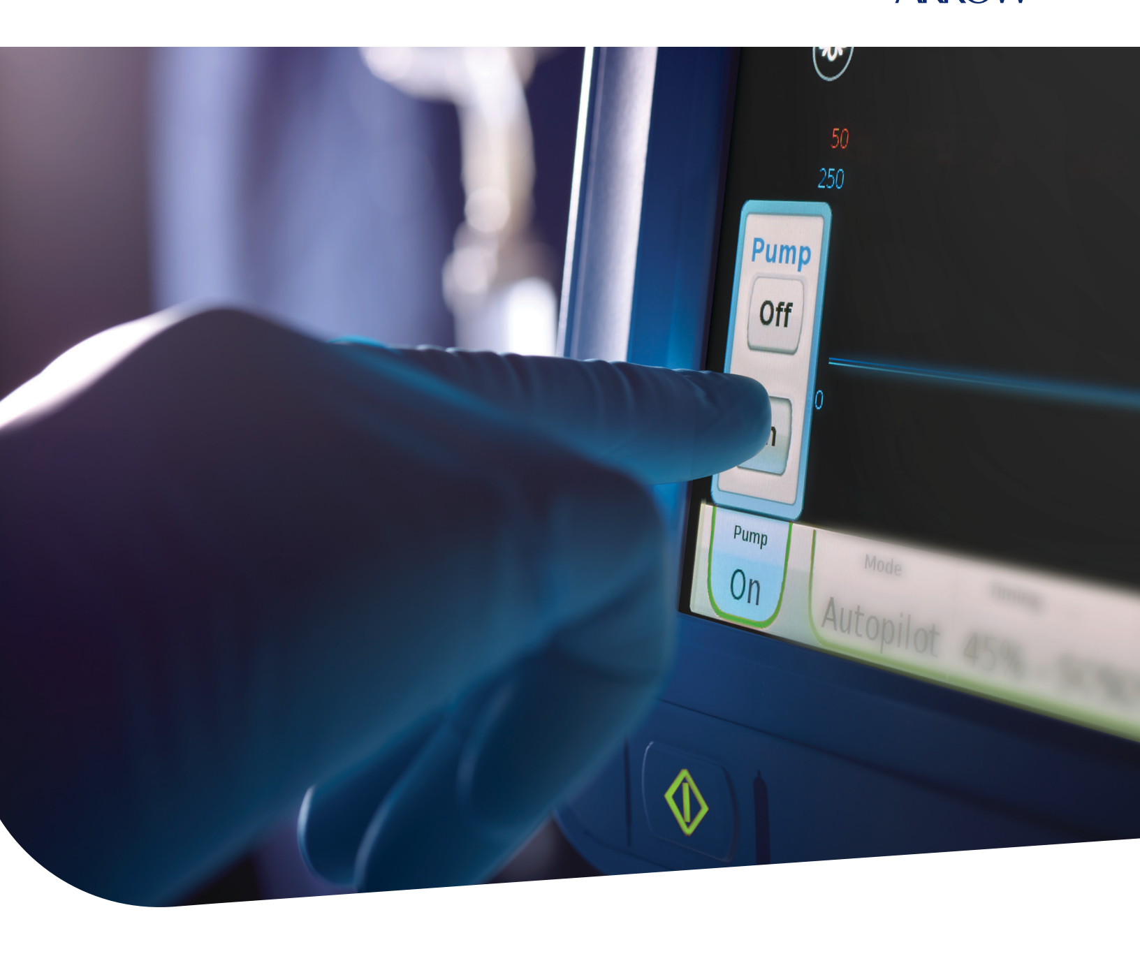
\begin{array}{c} \textbf{Arrow}^{\circ} \\ \textbf{AC3 Optimus}^{\mathsf{TM}} \ \textbf{Intra-Aortic Balloon Pump} \\ \textbf{Simply outstanding performance, support, and efficiency in an IABP} \end{array}