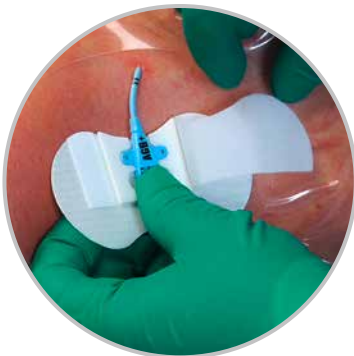
Suture-free fixation Grip-Lok ®