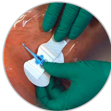
The soft, pre-cut, hub-shaped component ensures fixation and stabilisation